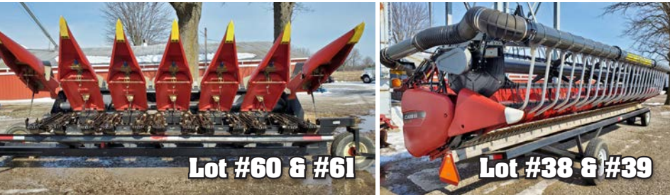
Lot #60 & #61

2014 Case/IH 5130 4WD Combine, only 1,087 eng hrs/704 sep hrs! deluxe cab, chopper, field tracker, folding bin hopper, HID lts, 30.5L32 tires, 480-70R30 rrtires, SN YFH230891, looks like new!